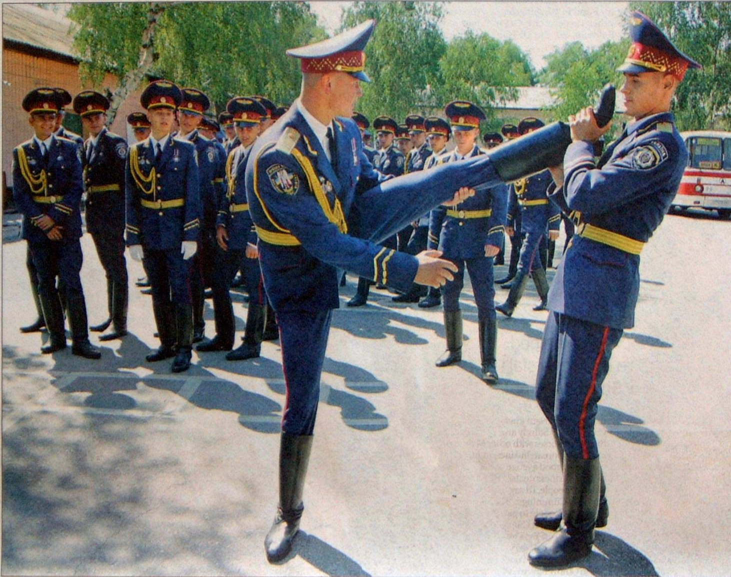
Ukrainian Interior Ministry soldiers at the Petrovtsi training centre near Kiev prepare to rehearse for a military parade marking the 13th anniversary of Ukrainian independence next Tuesday.