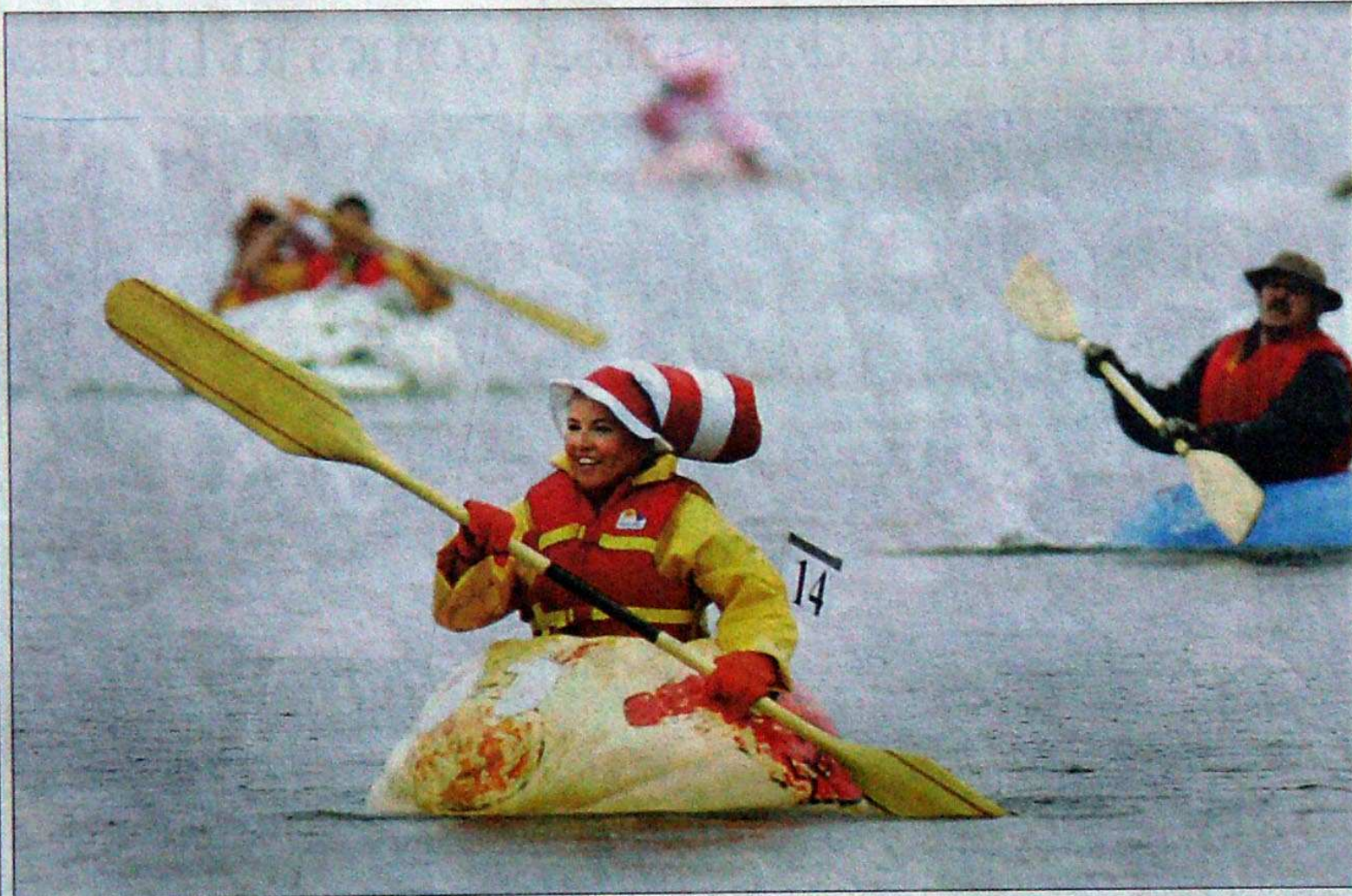
A paddler in a hollowed-out pumpkin heads for the finish line at a regatta on Falmouth Lake, in the Canadian province of Nova Scotia.