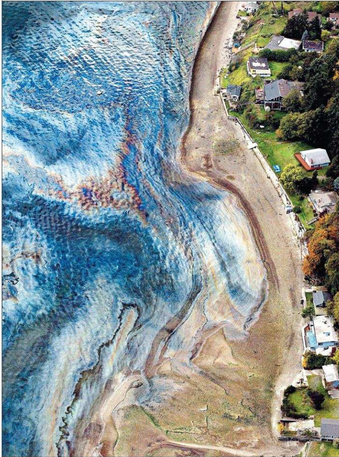
An oil spill, dispersed by tides and winds, creates a multi-coloured sheen on water lapping the beaches of Vashon Island, Washington state. Department of Ecology officials and spill contractors were trying to use booms to protect sensitive marine habitats.