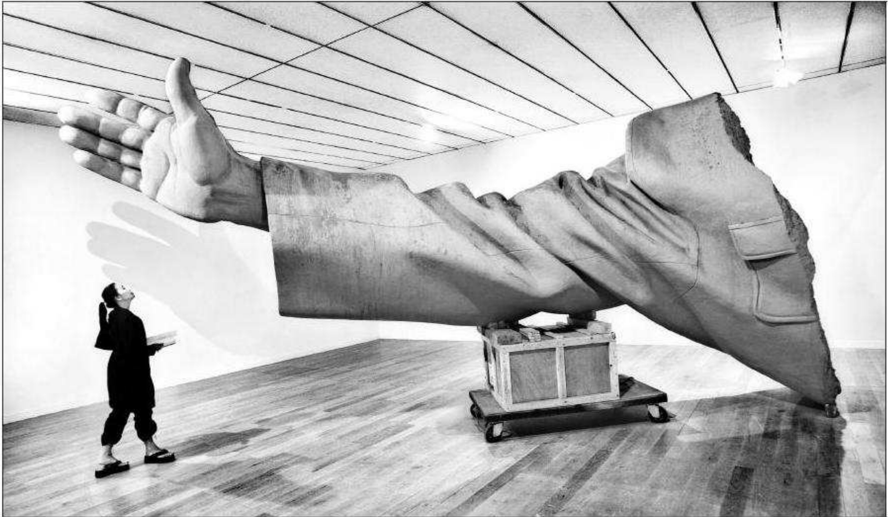
A visitor to the Contemporary Art Museum in the French city of Lyons looks at a sculpture by Chinese artist Sui Jianguo that represents the arm of Mao Zedong.