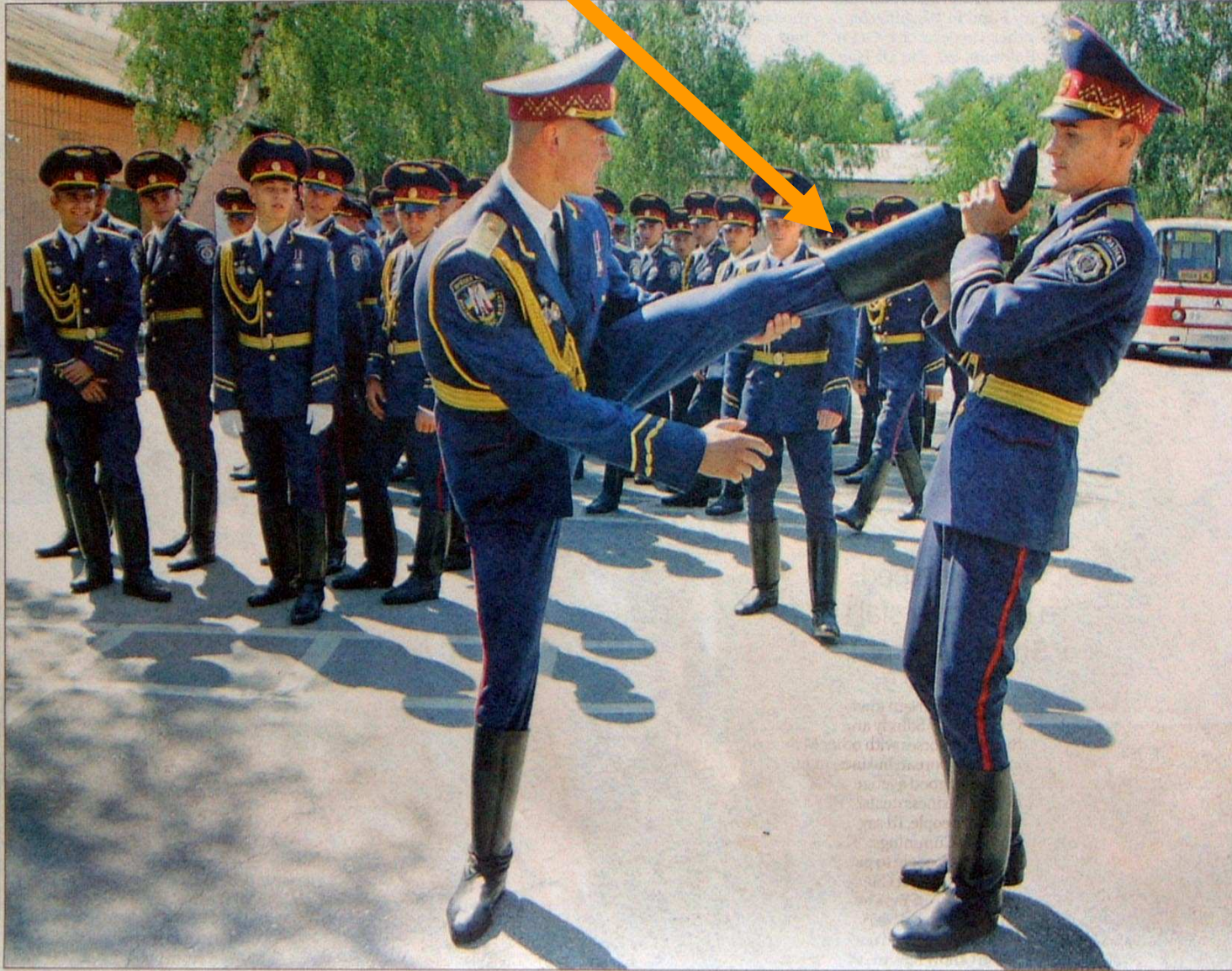
Ukrainian Interior Ministry soldiers at the Petrovtsi training centre near Kiev prepare to rehearse for a military parade marking the 13th anniversary of Ukrainian independence next Tuesday.