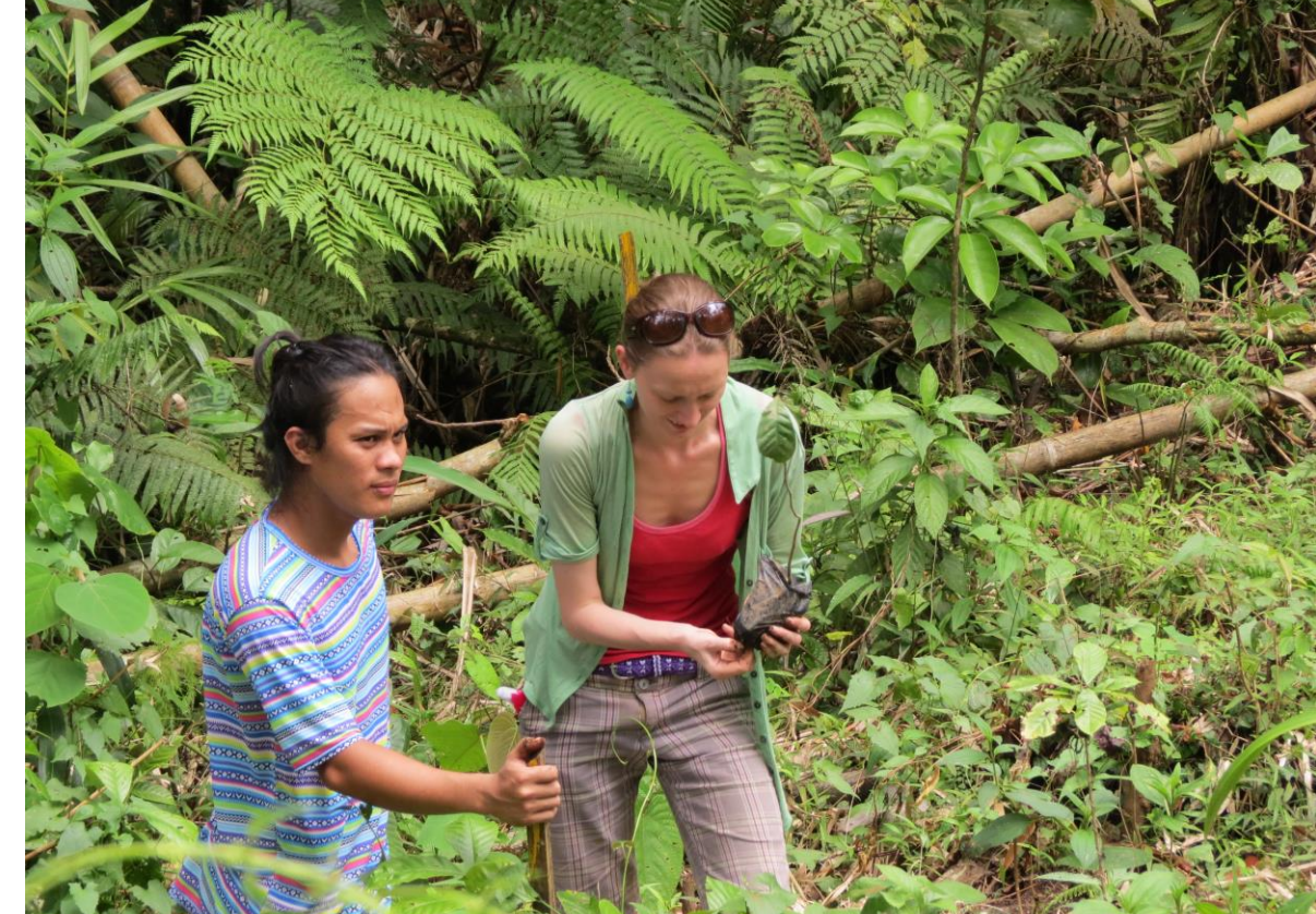
Discussion with community members regarding