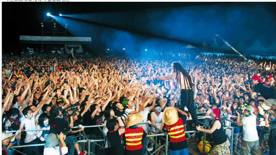
▲ Busan International Rock Festival