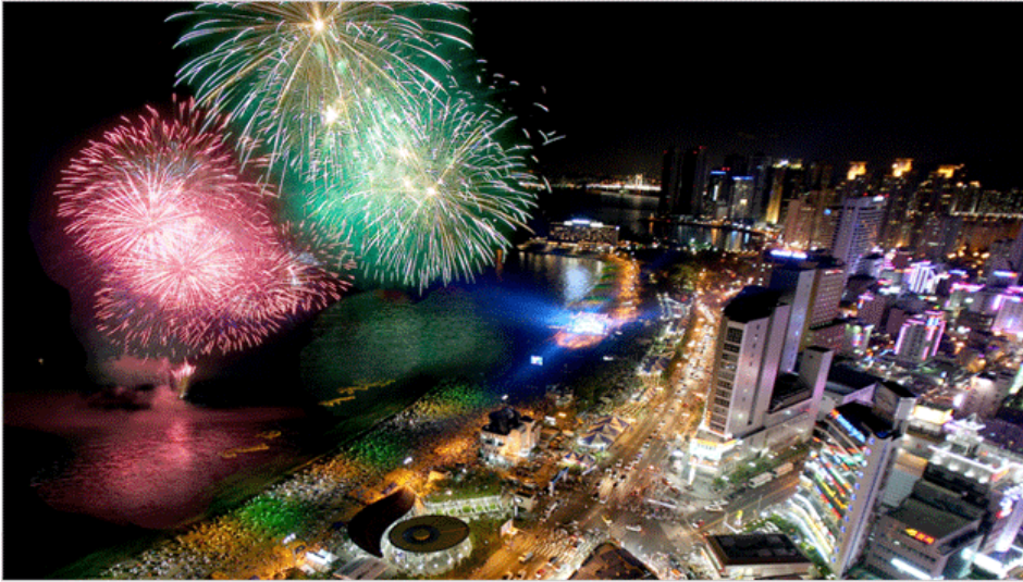
▲ 부산비바다축제 개막식 불꽃쇼 장면