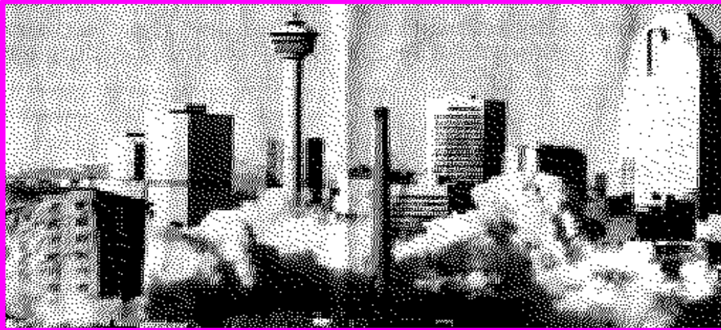
Original image from newspaper