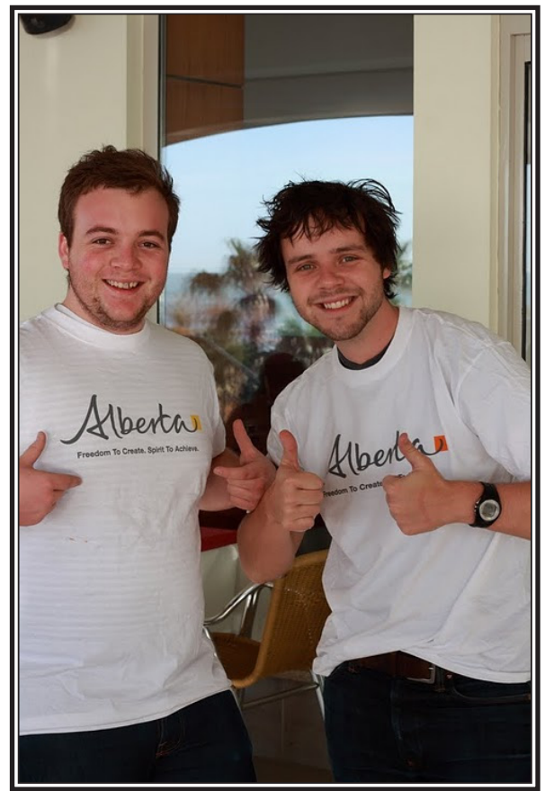
Even Worlds Champions can't resist Alberta