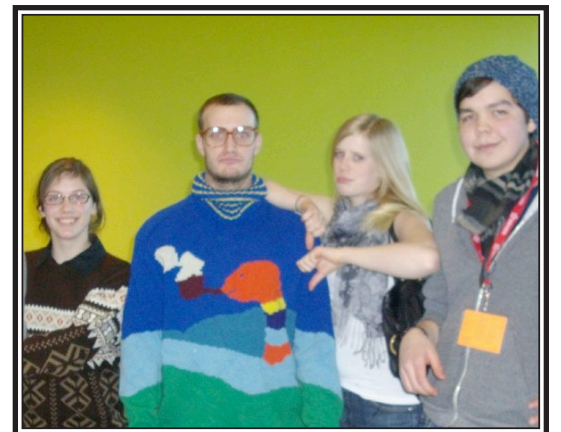
The UADS contingent shows off our ever classy style at York University