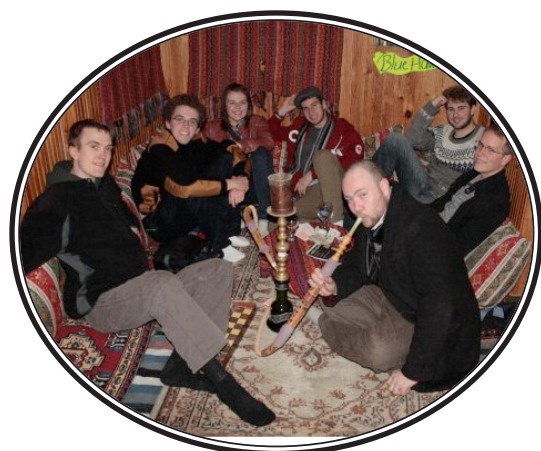
UADS travellers and friends experiencing Istanbul at its finest