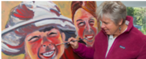
NURSE TO KNOW