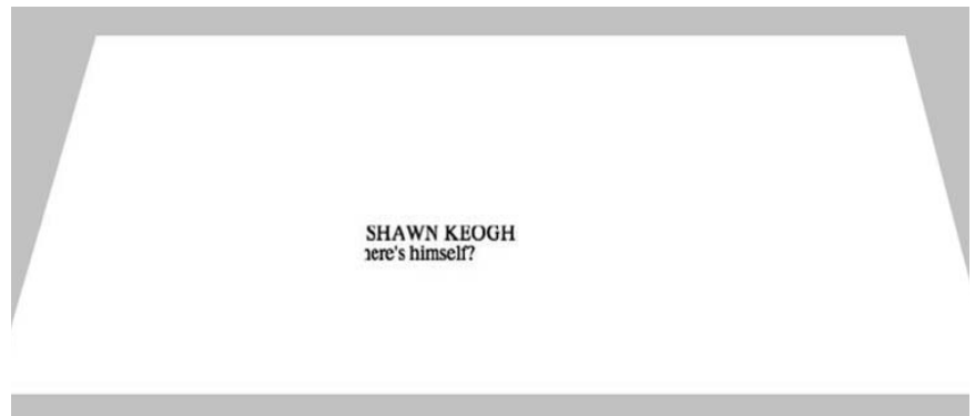
Figure 2: An early iteration of the Watching the Script environment attempted to represent an actual stage. Illustration Stéfan Sinclair

placed on a stage. This version of the interface was simple in the extreme but still angled, in an attempt to suggest an actual stage (see Figure 2). Although it had the virtue of simplicity, it was not a compelling environment.