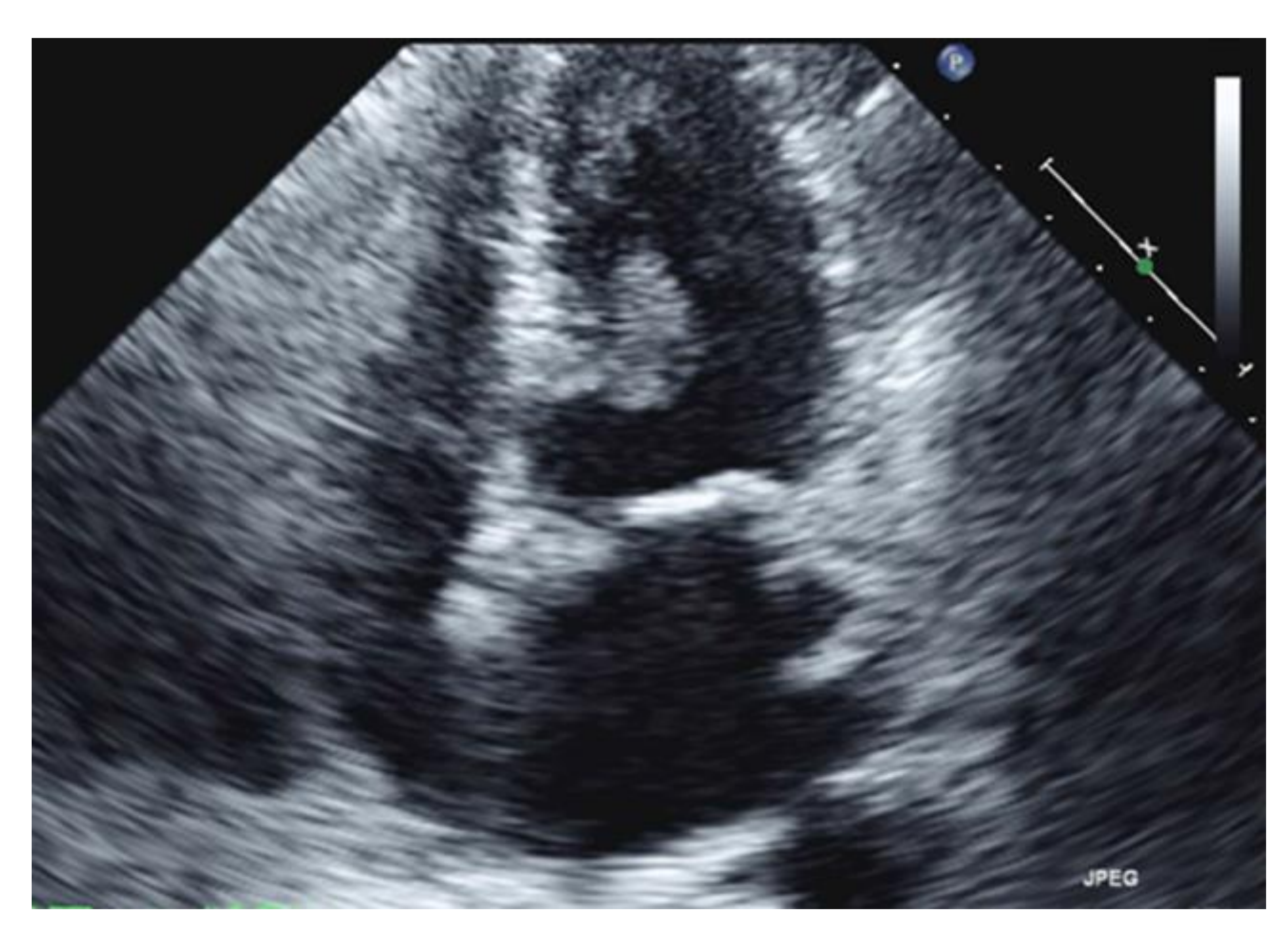
Figure 1 Transthoracic echocardiogram showing a mass attached to the mid septum of the LV.