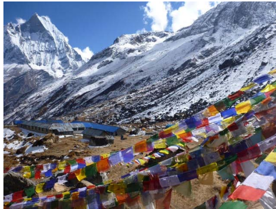
Annapurna Base Camp

Travel especially to Nepal, New Mexico, West Coast, UK, Amsterdam, Big Sur.