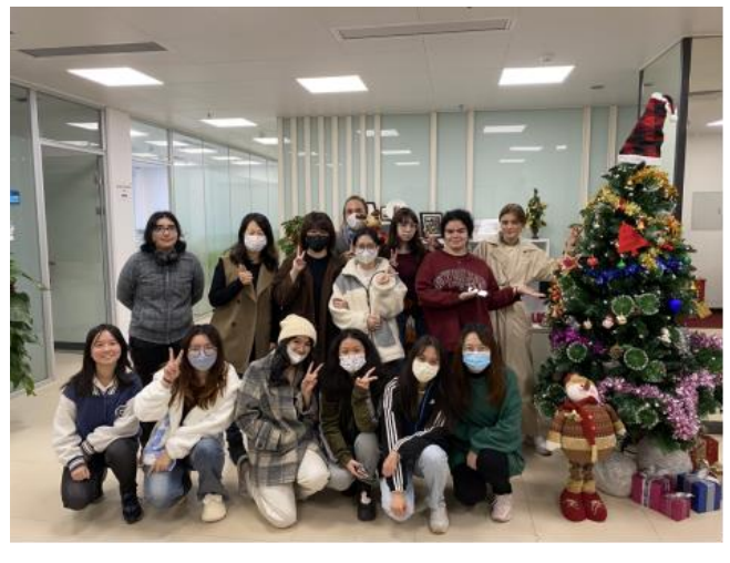
Christmas decoration with international and exchange in students