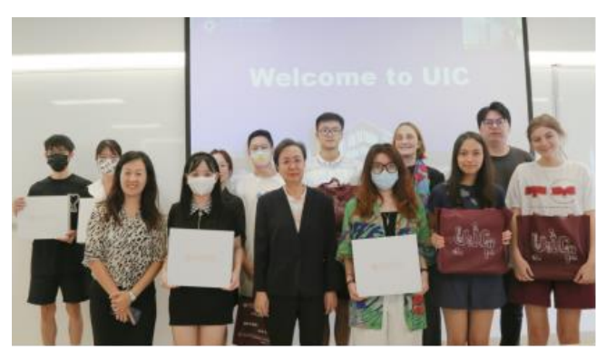
Orientation for international and exchange-in students