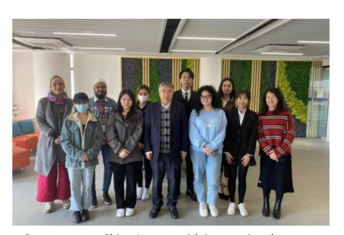
Contemporary China Lecture with international students