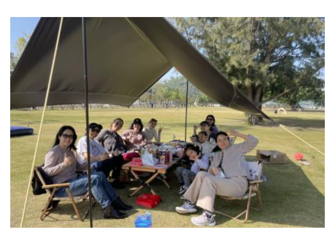
Picnic in Haitian Park with international students