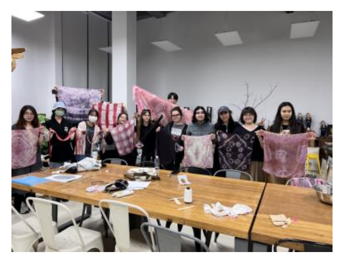
Natural Dye Experiential Workshop