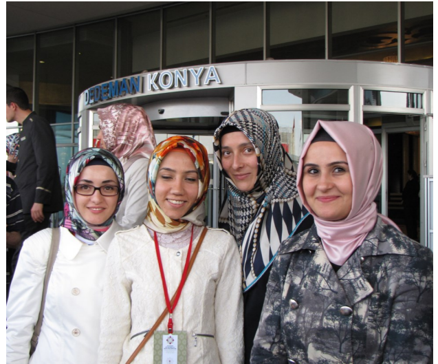
Students attending the conference in Konya

A partnership plan is under discussion that would bring theological students from Turkey to the Augustana Campus at Camrose for periods of intensive study of English and an introduction to religious life in Canada.