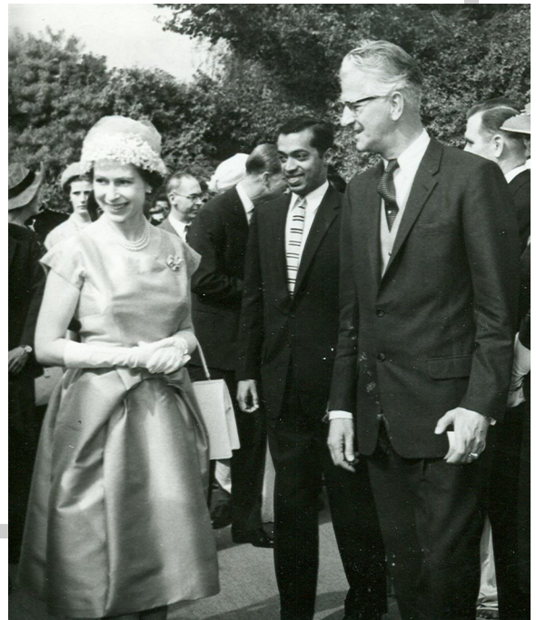
Photo of Chester Ronning with a young Queen Elizabeth