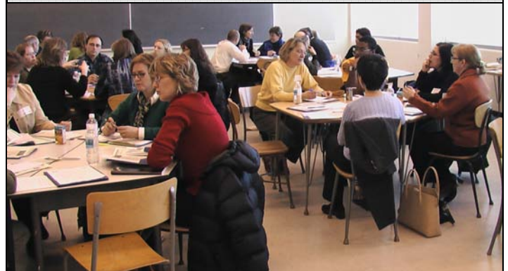
Participants from the Community-Engaged Learning Round Table discussion