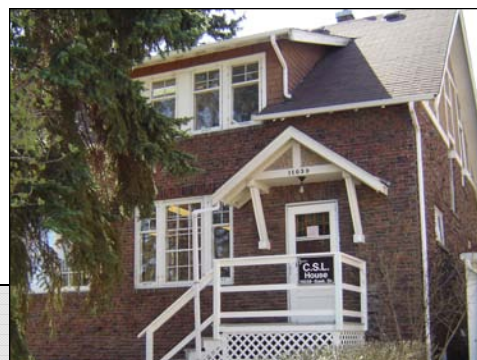
Community Service-Learning Program Faculty of Arts 11039 Saskatchewan Drive Edmonton, Alberta Canada T6G 2B4