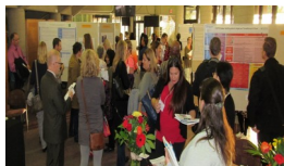
Strengthening Collaboration: EZ QMF, UAH DoM- AHS QI day and Patient experience