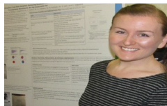
Building Capacity: Education & Projects