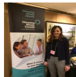
Measuring Improvement: Grants, AOC projects, Tableau dashboards