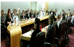
Access Partnership Project: 5 Phases and Connect Care Readiness