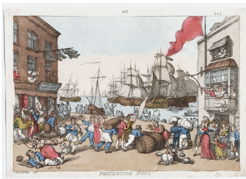
Figure 3— Portsmouth Point , 1814 by Thomas Rowlandson. lwlpr11731.

East End and districts south of the Thames were likewise defined by the seamen who resided there, an estimated 20,000 by 1750, along with the businesses and people tied to their adventures. 110 As with all great ports, East End London was a hybrid community absorbing different ethnicities, the largest maritime quarters in Britain. But there were innumerable harbors in the early modern world of similar character at different latitudes and longitudes, linked by global sea-lanes. The relationships between mariners and their shore-based networks were fundamentally important to the economic and cultural vitality of these regions, as the context of oceanic employment was unlike any other. 111 In 1776, the magistrate and writer John Fielding described the men who congregated in London's seafaring boroughs as "a generation differing from all the world." He added that "When one goes to Rotherhithe or Wapping, which places are chiefly inhabited by sailors . . . a man would be apt to suspect himself in another country. Their manner of living, speaking, acting, dressing and behaving are so peculiar to themselves." 112 Sailors were almost as often in port as at sea, loading, fitting a ship, and waiting to embark, their lives spent at least as much on land as under sail. 113 Most importantly, it was during these land-based periods