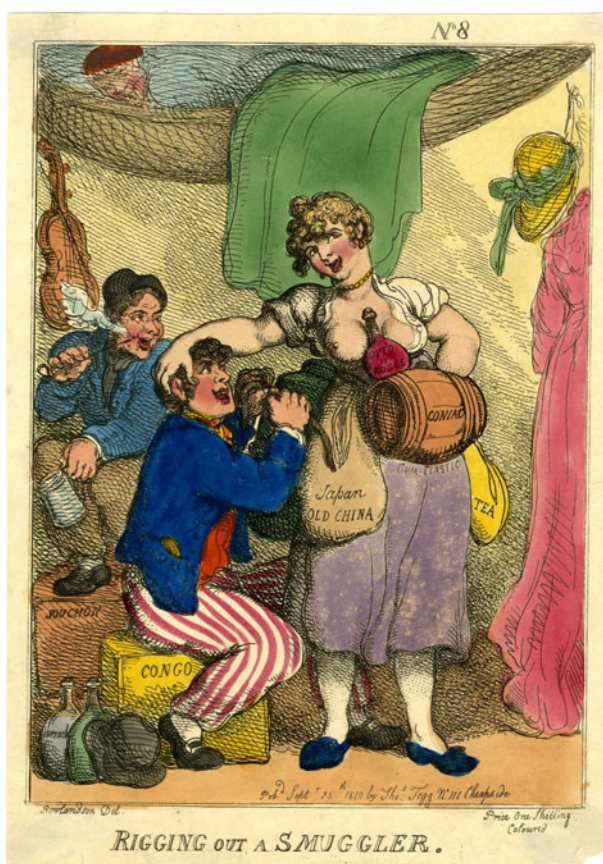
Figure 4— Rigging out a Smuggler, 1810 by Thomas Rowlandson. 1872, 1012.4954.

lovers, and prostitutes understood the benefits of sailors in port, whether in treats, wages, and useful or exotic gifts.