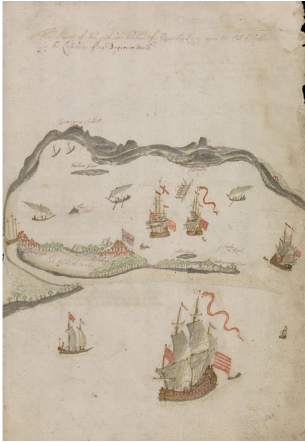
Figure 1—"The manner of the port and harbour of Bombay: Lying upon the Coast [sic] of India." Journal of Edward Barlow, 1659–1703. L3427-001.

We know some of the goods that mariners' acquired from the details of their wills; but bequests took various forms. Money represented a significant category of bequest in my sample of wills, rising slightly over time. Table 1 demonstrates the comparative prominence of cash bequests. Material bequests annotated as furniture, jewelry, merchandise, linen, china, tobacco, clothing, and silver ware are stipulated only occasionally. Overall, the generic grouping "goods and chattels" represented the largest category of bequest at over 50 percent in wills from 1685 to 1699, declining to about 40 percent in mariners' wills from 1700 to 1729 and then increasing to over 47 percent from 1740 to 1760.