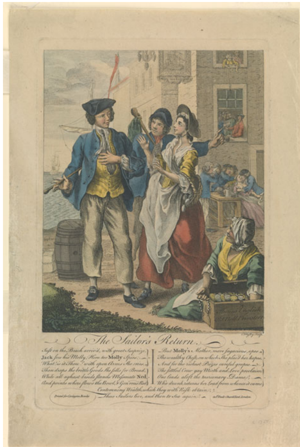
Figure 2— The Sailor's Return , c. 1750 by Charles Mosley, PW3801.

national, political and commercial purposes, satirizing and celebrating plebeian men unburdened by polite restraints. 97 Moreover, the disruptive and disorderly traits common to seafaring men were often those most cherished by recipients of their largesse on shore. Enterprise by stealth or under arms infused the culture of seagoing men, who were warmly received by family and friends when they returned laden with goods, even if customs officials and corporate administrators looked at them askance. Images like “The Sailor’s Return” stood as metonyms for countless unrecorded encounters that took place over generations, evidence of the cultural impact of these men, an effect that grew with the size of merchant and privateer convoys.