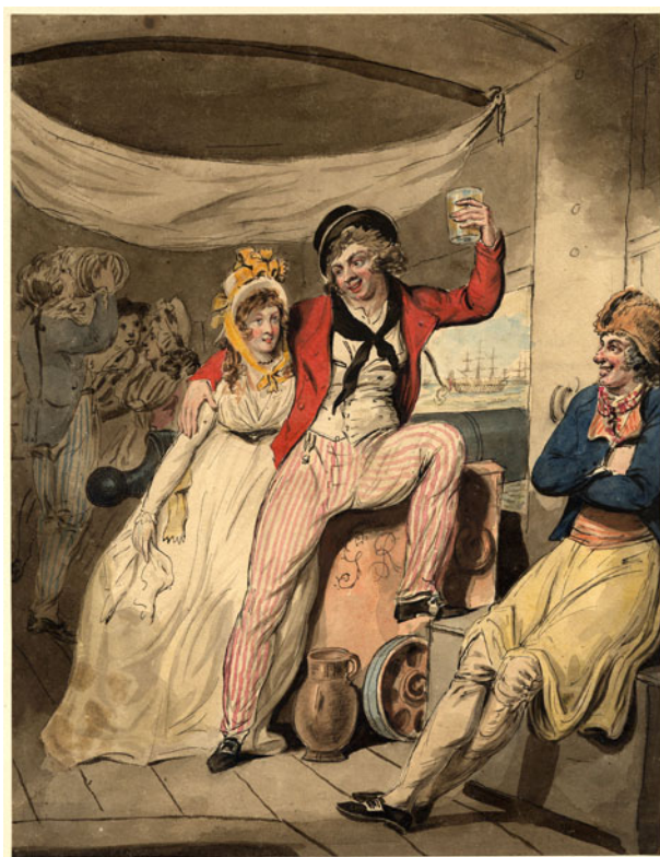
Figure 5— The Sailor's Sweetheart, c. 1790–1811 by Isaac Cruikshank. 1878, 0713.1256.

founded on skilled seamanship, expressed within global theatres of action. Their images were deployed in a range of cultural forms from print satires to theatrical representations, an alternative to genteel politeness and middling respectability. Print and ceramic objects reinforced the increasingly iconic status of this group and spread the range of their influence. The experiences of empire, the habits of seafaring life, and the selective idealization of these plebeian men shifted the norms of material culture and manly demeanor. 152 Mariners' iconic consumer practice was powerfully productive of change. Seafarers, traversing global trade networks, disrupted traditional practice, innovating new discursive material cultures and new forms of masculinity, becoming a recognizable and authoritative community of men.