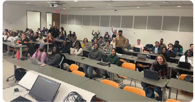
Students of SPH 563, a graduate course in the School of Public Health where students gain an overview of evaluative thinking and practice