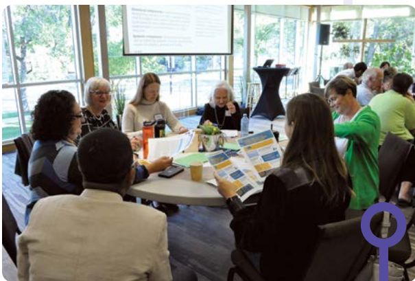
CUP's knowledge-to-action workshop on September 26, 2024