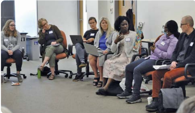
Award recipients sharing their experiences with the CUP Steering Committee