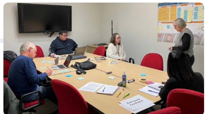
Members of the CUP-ECELC research team at a group discussion organized by CUP

The ECELC has released five reports on the survey results, along with executive summaries and one-page infographics to help readers digest key findings.