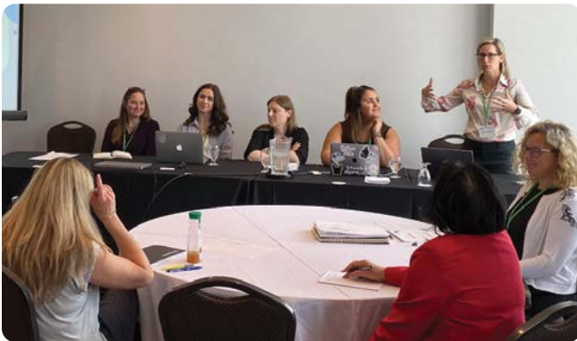
ECN members co-presenting at the 2023 Canadian Evaluation Society conference in Quebec City