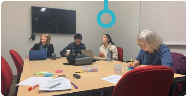
Members of the CUP-ECDC research team at a group discussion organized by CUP

the 1960s as a way for communities to guide their own development and address poverty. The model has rarely been used in Canada, beyond a few notable case studies, and there is scant research to help determine the model's usefulness in a Canadian context.