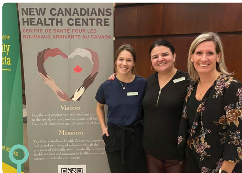
CUP researchers and partners from the New Canadians Health Centre at the University of Alberta's Social Innovation Lectures