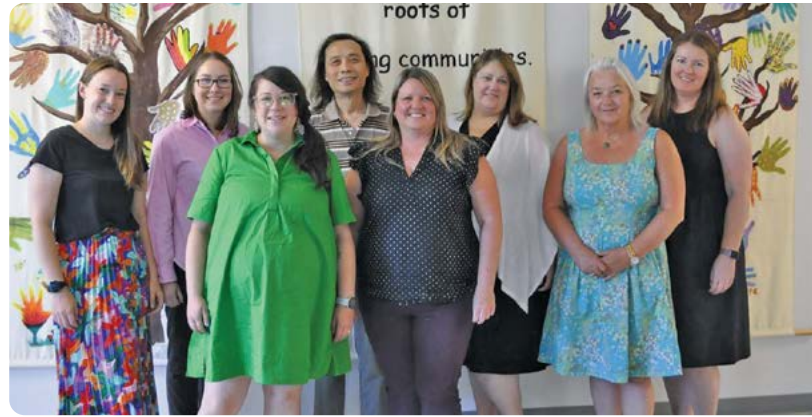
CUP and partners at the Head Start Steering Committee meeting on July 8, 2024