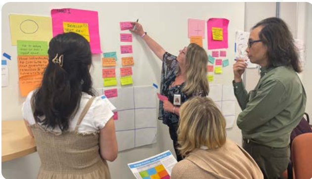
Members of CUP's Steering Committee at a reflective session in June 2024