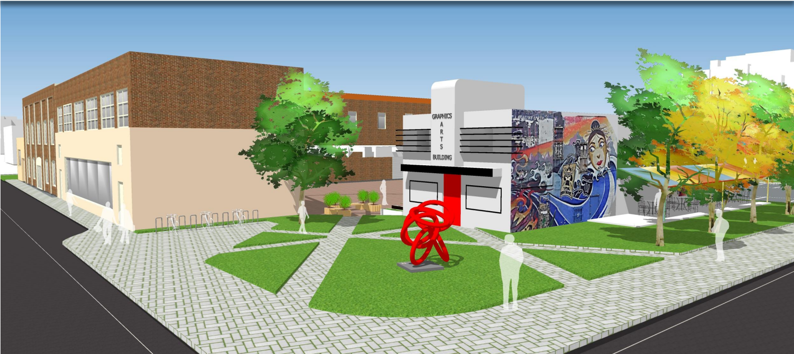
Bird's eye view of a 3D model of our proposed plan for the Iron Works Complex, Graphic Arts Building and adjacent lands, looking north-east from the corner of 96 Street and 104 Avenue, Edmonton