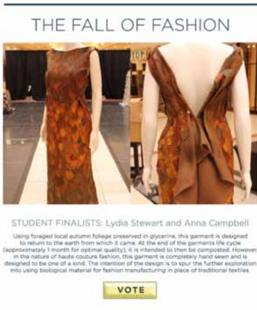
Image of winning eco-challenge entry