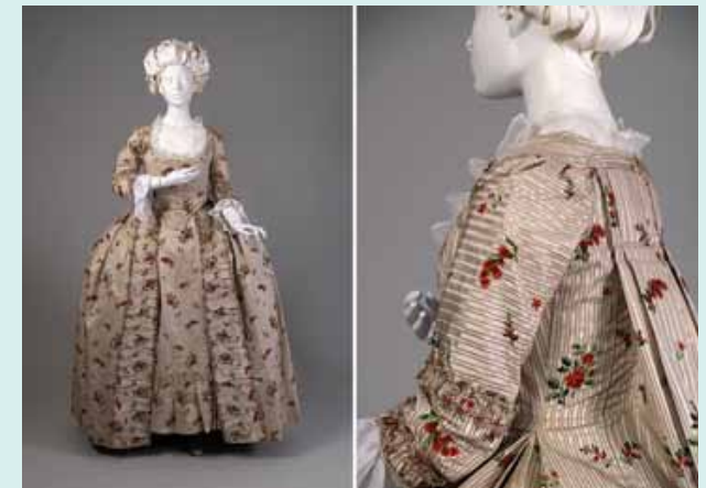
Our artifact in the exhibition at the Norton Museum in Florida. Ivory brocaded robe à la française and matching petticoat, 1775–mid 1780s, France, silk brocade with stripes and floral motifs. Clothing and Textiles Collection, Department of Human Ecology, University of Alberta (2014.1.1.a, b)