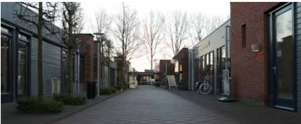
^ de Hogeweyk Village, Netherlands

the village, and in the community beyond. The film, based on research conducted in February 2015, offers a glimpse into the intricacies of people's relationships with things, offering rich descriptions of how people relate to objects and/or spaces. The film features comprehensive observations of residents, family, friends and workers within the public and private spaces of de Hogeweyk, focusing on the design of spaces and objects that have never been documented before. In North America, dementia's disease progression is typically marked with the need for a person to move from their home to an institutional environment. This research highlights the importance of understanding how material culture can make a difference in supporting the wellbeing and enhancing the quality of life of residents with dementia. It may mark the beginning of reimagining innovative ways to respond to dementia care by design in the Alberta context.