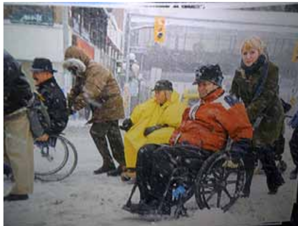
Visitors to an exhibit at the Canadian Museum for Human Rights, Winnipeg, Manitoba