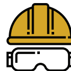
Commitment to safety