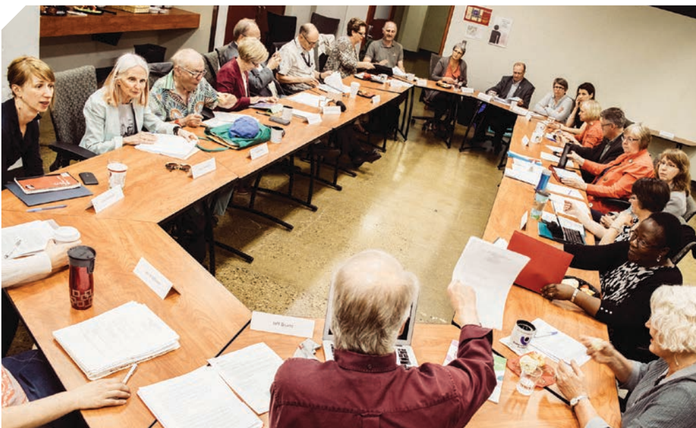
CUP Steering Committee Meeting 2015 ▼