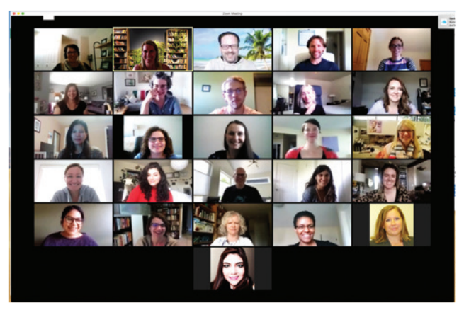
UEVAL, SUMMER 2020

As the global pandemic continues to highlight the enduring evaluation gaps in the social sector, we are faced with the question: "how will we meet the moment?" For the Evaluation Capacity Network (ECN), the challenges of a world gone virtual was seen as an opportunity for wider reach and impact. Rapidly pivoting to online platforms, the momentum of the ECN has accelerated over the past year, as the Network continues to discover and test innovative evaluation capacity building approaches in collaboration with community partners, practitioners, academics, and students across North America.