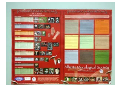
Poison Mushrooms Poster (Out of print)