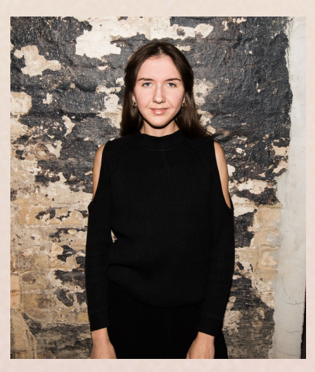
Find Out More and/or register: