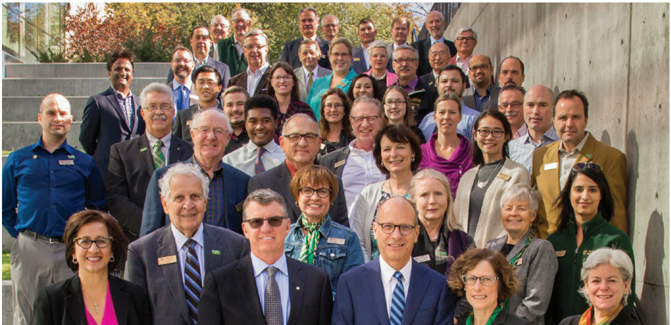
Chancellor and Senators at September plenary 2016

A re-imagined campus United Way campaign is launched in September 2017 with the goal of increasing campaign totals and participation rates among faculty, staff, and students.