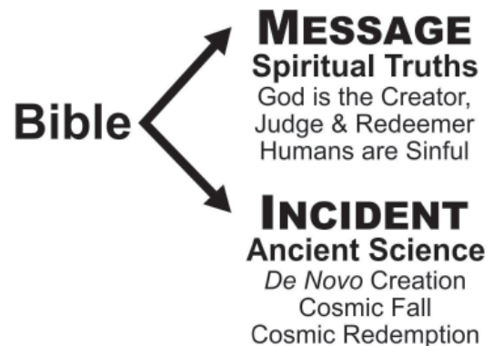
Figure 6. The Message-Incident Principle and a Non-Concordist Interpretation of the Bible's Creation-Fall-Redemption Metanarrative

To move beyond concordism and conflation, it is necessary to separate the incidental ancient science from the Holy Spirit's life-changing messages of faith. I term this hermeneutical approach the "Message-Incident Principle." 67 In this way, the ancient paradigms of the physical world embedded in the Creation-Fall-Redemption metanarrative become vessels that deliver metaphysical or spiritual foundations of the Christian faith. A nonconcordist interpretation of this grand narrative in scripture redirects attention to the inerrant spiritual truths. Figure 6 presents the Message-Incident Principle and separates the spiritual messages associated with